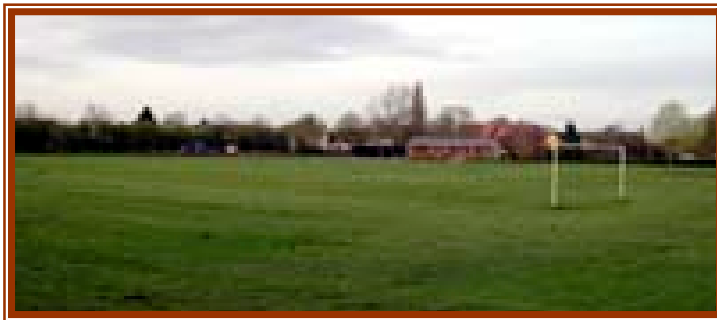
The Rec – Christian Malford

To provide sufficient facilities to allow all age groups within Christian Malford the ability to pursue appropriate recreational activities.